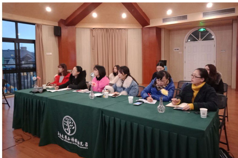
图2 中方激烈讨论 (Chinese side heated discussion)