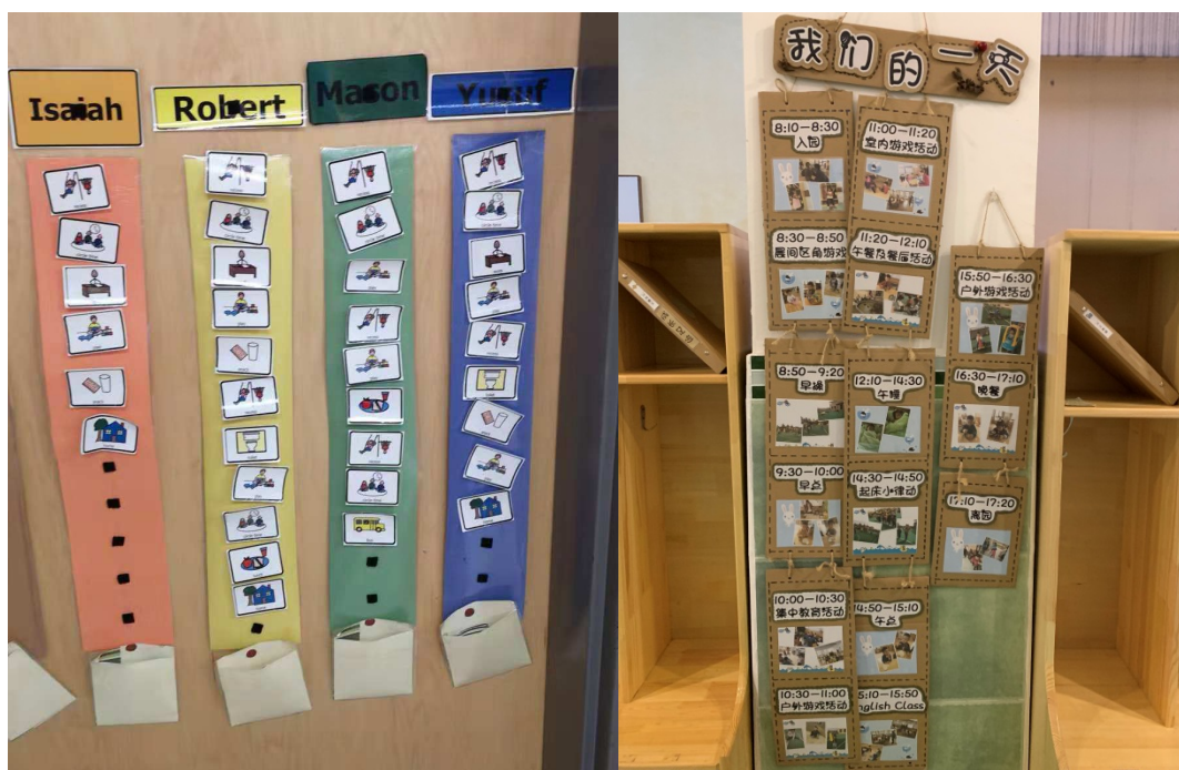
图3 中加方老师展示孩子的每日计划 (Chinese and Canadian teachers present children's daily plan)